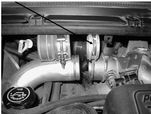
Ref. A- Power Plate