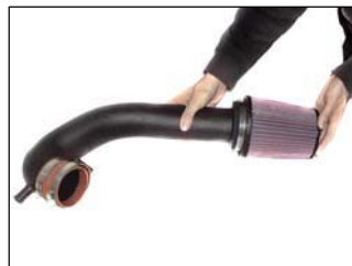
Fig. # 14