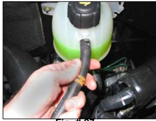
Fig. # 27