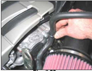
Fig. # 29