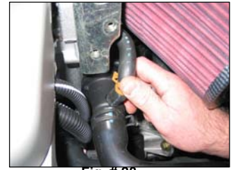
Fig. # 28