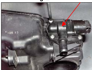
Fig. # 21