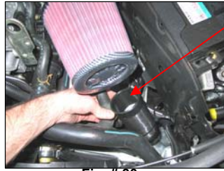
Fig. # 30