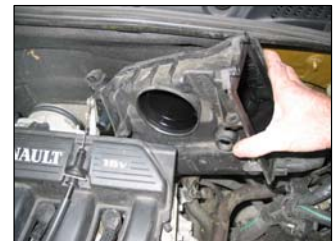
Fig. # 12