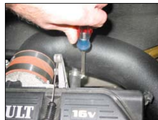
Fig. # 19