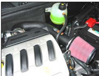
Fig. # 33