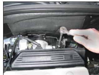
Fig. # 11