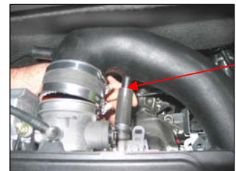
Fig. # 16