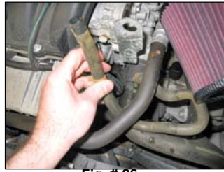
Fig. # 26