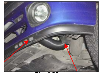
Fig. # 32