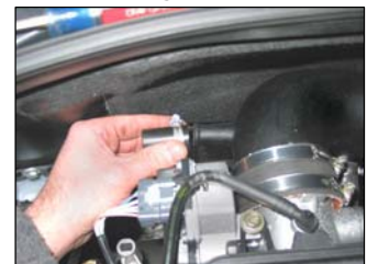
Fig. # 20