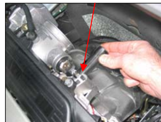
Fig. # 15