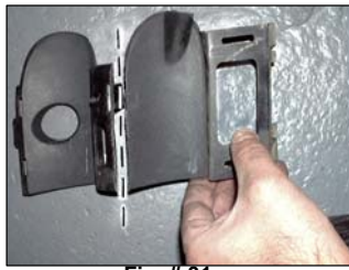
Fig. # 31