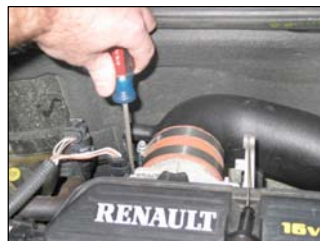
Fig. # 18