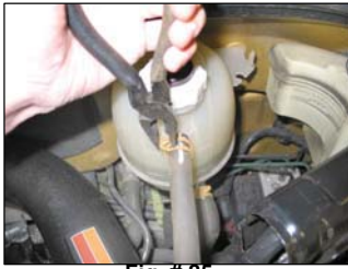
Fig. # 25