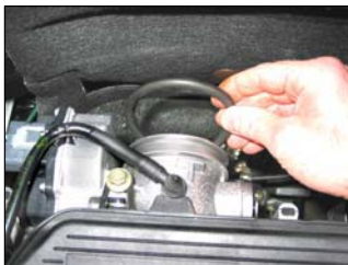
Fig. # 13