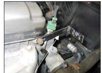
Fig. # 12