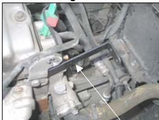
Fig. # 13