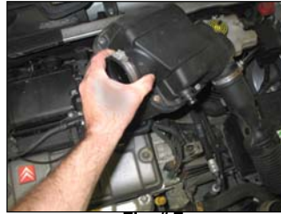
Fig. # 7