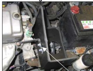
Fig. # 15