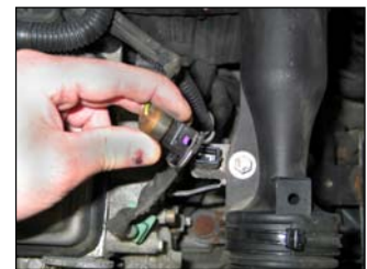
Fig. # 4