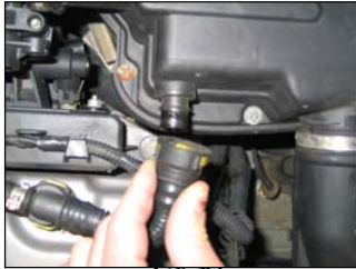
Fig. # 5

Citroen Saxo VTR 1.6L 8v 98bhp Sept'00-Feb'04