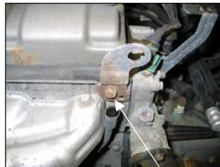
Fig. # 11