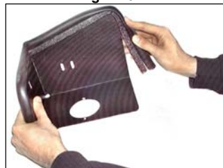
Fig. # 14