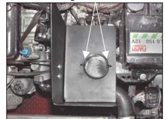
Fig. # 16