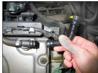
Fig. # 10