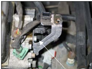
Fig. # 9